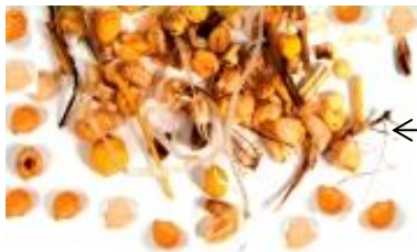
Floatable debris removed from chickpeas cleaned via SHRI